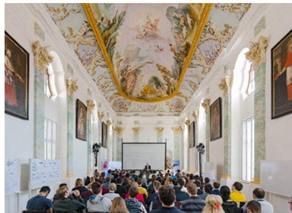
Impression from our Kick-Off Seminar.

This new process only concerns the Kick-Off seminars at the TUM Science & Study Center Raitenhaslach ; spots in the online version of the