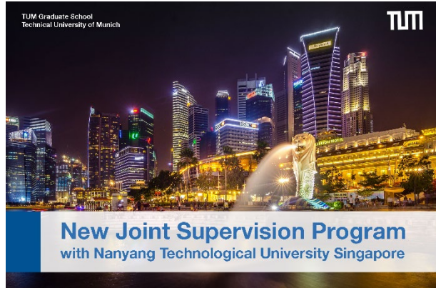
Singapore by night

Are you ready to broaden your international profile? The TUM-NTU joint supervision program is your chance to benefit from the expertise and academic co-supervision of your TUM supervisor and an NTU co-supervisor.