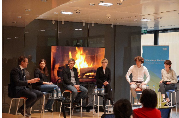
Fireside Chat summer semester 2023

Become inspired and step forward in your career and professional development focusing on research! Be our guest at the panel discussion on 16 May, 6 p.m., jointly organized by the TUM Graduate School and the TUM: Junge Akademie . Many roads lead to a fulfilling career – no matter if staying in academia is your ultimate career goal or just a milestone towards industry employment or other purposes. However, one thing is certain. Irrespective of your chosen career path, there will be others competing for the same position or opportunity.