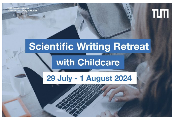
Person writing on a laptop.