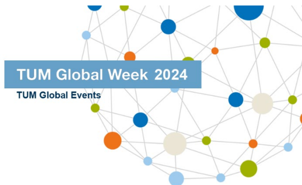
TUM Global Week 2024

For doctoral candidates, TUM-GS offers the info session " Internationalize your doctorate - Global opportunities for your doctoral journey " on 15 May, 2 p.m. at campus Garching-Forschungszentrum. Here you can find out more about funding opportunities for conference trips or longer research stays or practical tips for making contact with international scientists.