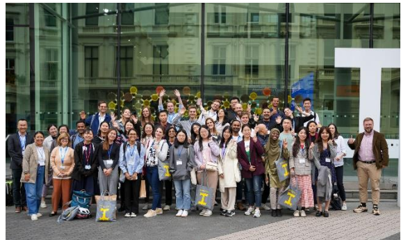
Participants of the Global Fellows Program 2024 in London

The trilateral Global Fellows Program will take place this year from 28 July to 1 August 2025 at TUM in Munich. The annual 5-day summer school is jointly organized by TUM, Imperial College London, and Nanyang Technological University. Save yourself one of the last spots, spend one week with 40 other doctoral researchers from the three partner universities, and boost your professional and personal skills. This year's program is about "Multidisciplinary solutions for climate-responsive societies." Extended deadline until 15 April 2025.