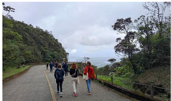
TUM doctoral candidates in Brazil 2024