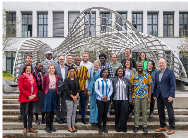
Welcome to TUM and Munich!