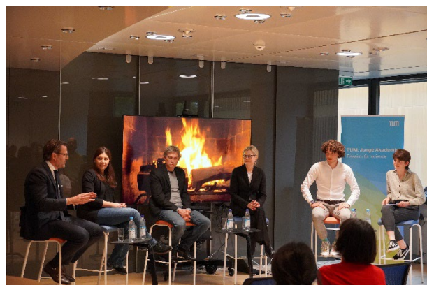
Fireside Chat summer semester 2023

Become inspired and step forward in your career and professional development focusing on research! Be our guest at the panel discussion on 16 May, 6 p.m., jointly organized by the TUM Graduate School and the TUM: Junge Akademie . Many roads lead to a fulfilling career – no matter if staying in academia is your ultimate career goal or just a milestone towards industry employment or other purposes. However, one thing is certain. Irrespective of your chosen career path, there will be others competing for the same position or opportunity.