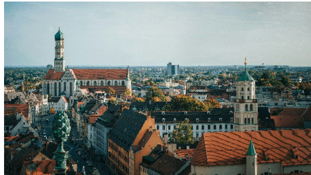
Panorama of Augsburg

You have recently started your doctorate and would like to connect with peers while enjoying the nature and culture of Bavaria? Then come and join our Welcome@TUM-GS Event Program with our next trip coming up on 18 May: Let's leave Munich and visit the city of Augsburg. Augsburg has a rich history – the city's water management left behind many monuments from the late Middle Ages to 1972. A total of 22 objects are part of the UNESCO World Heritage. The tour leads from the town hall square through the artisan old town to the waterworks at the Red Gate: one of the three water towers is the oldest water tower in Central Europe.