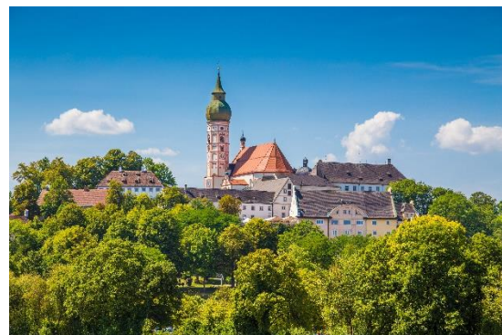
Kloster Andechs

It's time again for a hike to Kloster Andechs, the lovely monastery on top of a small hill between Lake Starnberg and Lake Ammersee in the south of Munich. We will meet on Saturday, 28 June, at 10 a.m. at the S-Bahn station Herrsching. Get to see the idyllic Bavarian landscape and enjoy typical Bavarian food and drinks in the welcoming "Biergarten." After the hike and before returning to Munich, you can take a refreshing dip in Lake Ammersee. Therefore, don't forget to bring your swimwear! The family-friendly hike suits beginners and will be mainly in the shade (as we will hike through a forest).