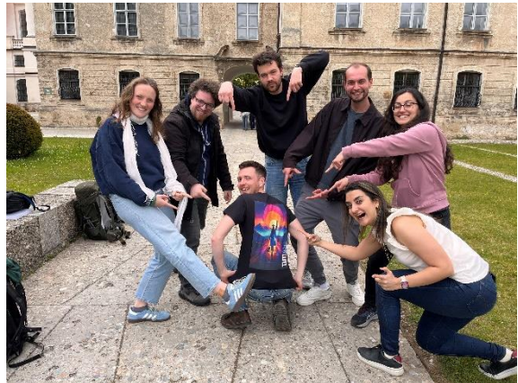
TUMblue Working Group in Raitenhaslach

They are looking for enthusiastic volunteers to help organize: Food & Drinks, Music, Fun & Games, Theme & Design, Social Media, Accounting ... and more exciting activities!