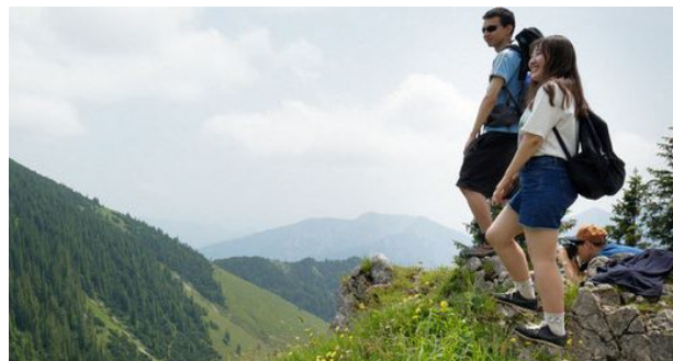
Hiking tour of our cultural program

Do you want to network with your fellow doctoral candidates and to get to know TUM, Munich, Bavaria and its cultural heritage? We are happy to announce that our cultural program is back! This summer, we have planned great outdoor events, including a hike to the Andechs Monastery, a Nightwatchman City Tour and a hike in the Mangfalltal. Our upcoming hike to the beautiful Andechs Monastery takes place on July 30 and you can already save your spot, as the number of available places for particular events is limited. You will find more information on our website!