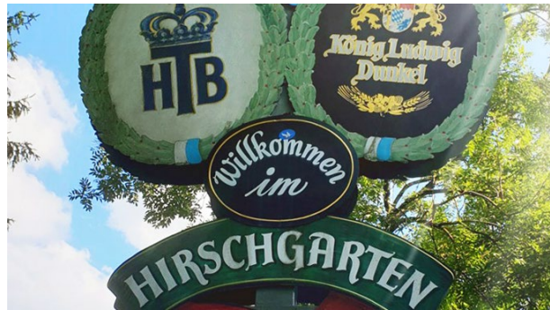
Sign at Hirschgarten

You are an international researcher and want to get to know your peers? The Welcome Services teams of TUM Graduate School and the TUM Global & Alumni Office invite all international researchers to join us for an informal get-together in the Hirschgarten beer garden that is one of Munich's most popular beer gardens. The Welcome Services of the TUM Global & Alumni Office will sponsor a couple of Bavarian cuisine platters. In traditional Bavarian beer gardens, you can bring your own food. We therefore kindly ask you to bring a favorite dish/ snack from your home country to turn our get-together into an international buffet. Please note that you will have to pay for your beverages!