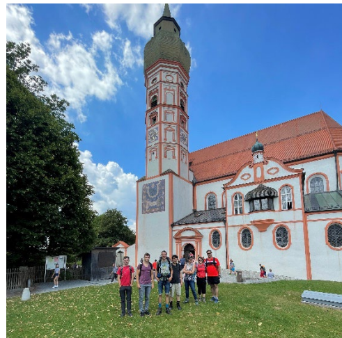
Impression from last's year hike

Welcome@TUM-GS is an event program especially created for new doctoral candidates who started their doctorate during the last 12 months and want to meet in a leisurely setting to explore TUM, Munich and its surroundings. Come join us On July 15 th for our recurring hike to Kloster Andechs, the lovely monastery situated on top of a small hill between lake Starnberg and Ammersee in the south of Munich. Get to see the breathtaking Bavarian landscape and get to taste all the Bavarian goodies the monastery has to offer once we reached its welcoming „Biergarten“. Let's enjoy the beer, the food and the view. Don't forget to take your swimsuit with you! The hike is suitable for beginners and will be mainly in the shade (as we will hike through a forest). Register now via email .