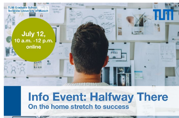
Person looking at a clipboard.

Are you already further along with your doctorate and looking for support, guidance and inspiration about how to master the home stretch of your doctorate? In our info event series "Halfway there – on the home stretch to success", we will guide you through mandatory elements of the doctorate at TUM, provide you with an overview of our tailor-made course options for career planning and orientation, as well as an overview of TUM-GS/TUM services that might be particularly interesting for the second half of your doctorate. Among others, we will be covering the following topics: