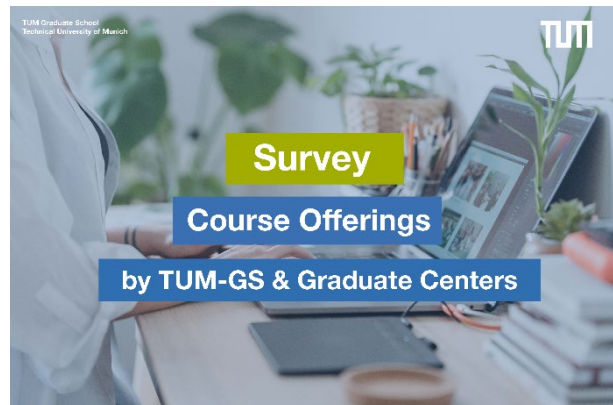
Person typing on a laptop

It only takes around 5 minutes of your time to complete our survey and make your voice heard. Your input is greatly appreciated. The survey is open to all TUM doctoral candidates, regardless the number of visited courses. Thank you! ☺