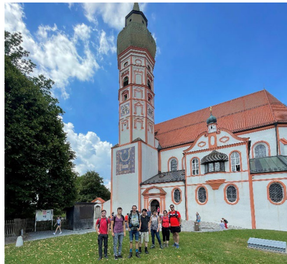
Impression from last year's hike

Together, we will hike to Kloster Andechs, the lovely monastery on top of a small hill between lake Starnberg and Ammersee in the south of Munich. Get to see the breathtaking Bavarian landscape and taste all the Bavarian goodies the monastery has to offer once we reach its welcoming „Biergarten.“ Let's enjoy the beer, the food, and the view. Don't forget to take your swimsuit with you for a swim in lake Ammersee after the hike! The hike suits beginners and will be mainly in the shade (as we will hike through a forest).