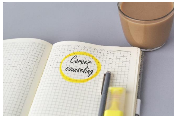
Notebook with the phrase "career counseling"

Depending on individual requirements and concerns, a maximum of five 60-minute online meetings is possible. Please note: for a professorship at a UAS, you need German language skills of at least C1. The coaching is therefore also only offered in German.