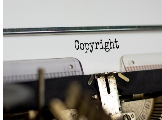
Copyright text on a typewriter

We invite all TUM doctoral candidates to our “Introduction to German Copyright” webinar. In this session, doctoral candidates will learn everything about German copyright law relevant to their role as lecturers and authors. Find out what doctoral candidates must consider when using copyrighted material from others, such as pictures or charts. Additionally, participants will familiarize themselves with the rights concerning their work and how to make it available for reuse through Creative Commons licenses. The webinar, held by publishing experts from the TUM University Library, provides doctoral candidates with essential knowledge of German copyright regulations and features a Q&A session to address their specific concerns.