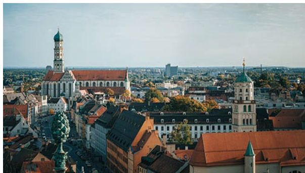
Augsburg's panorama

Let's leave Munich and go visit the city of Augsburg with its rich history. Join us on August 27 on our tour through the various neighborhoods to explore the city's past and present. The guided tour includes an entrance to the Fuggerei, the world's oldest social housing settlement dating back to 1521 as well as the town hall with its golden room. Be quick and save one of our spots now! The fee for the tour is €14, you will find more information on our website .