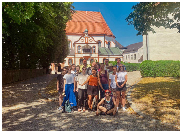
The TUM-GS and IGSSE management team in front of Andechs Monastery

As some of you might know, our TUM-GS management office team has been growing continuously as we welcomed many new colleagues since last year. If you would like to know more about our team and our current projects, stay tuned and follow us on Instagram!