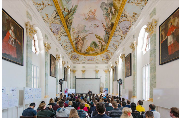
Impression from our Kick-Off Seminar.

What awaits you at the TUM-GS Kick-Off Seminar? In three days, you will receive important information about doctoral research as well as an introduction to Good Scientific Practice. Additionally, there will be numerous opportunities for networking through activities such as a guided Walk & Talk and a custom-designed Escape Game.