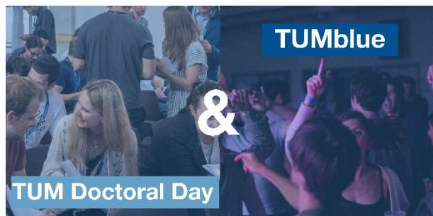
TUM Doctoral Day & TUMblue on 27 September 2024.