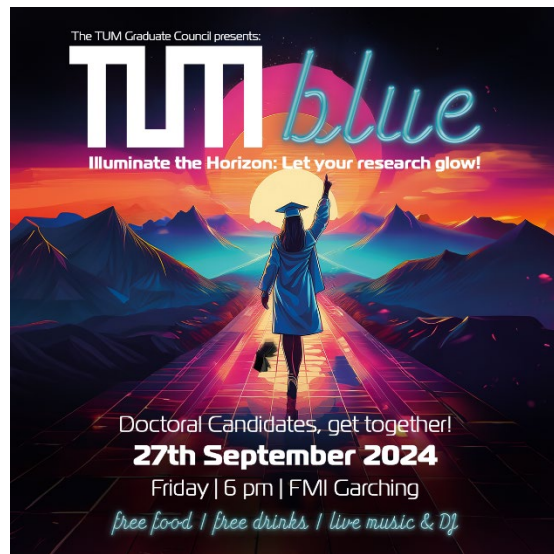
TUMblue 2024 - Let your research glow! (Poster: Stuart Daniel James & Photoshop Generative AI)