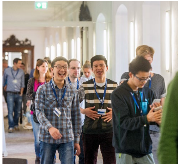
Doctoral candidates at our kick-off seminar.