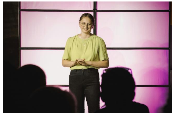
A woman presenting at a stage

This fast-paced science communication contest – taking place during TUMblue on 19 September – gives you 3 minutes to share your research with a curious and supportive crowd – no slides allowed, just your ideas, energy, and whatever props you can carry on stage. Doctoral candidates from each TUM School will go head-to-head to see who can communicate their science the most clearly, creatively, and convincingly. The winning performance takes home a great prize – and serious bragging rights for their Graduate Centre.