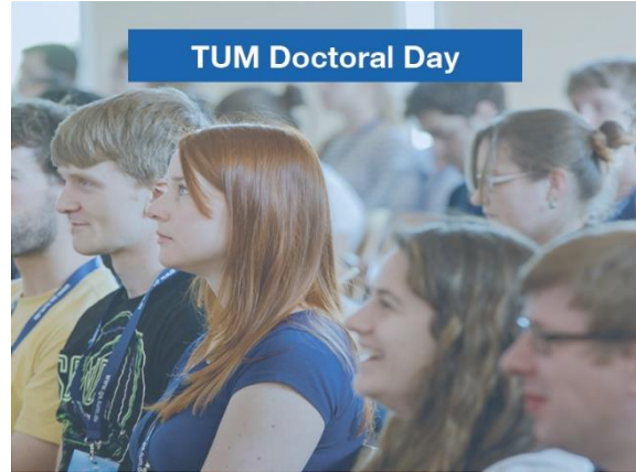
Doctoral candidates in the audience