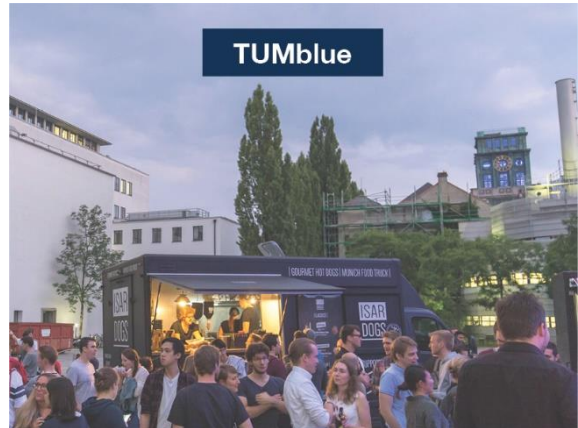
Doctoral candidates at TUMblue

This year's theme, "TUMblue da ba dee da ba di – Defend your thesis, not your dance moves," sets the tone for a vibrant night of science, music, and games. You can look forward to a dynamic science communication competition, live performances, engaging activities at the DocRepGames Fair, and a DJ stage that will keep the party going until late.