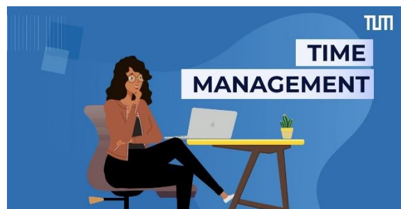
Skills Booster: Time Management Video