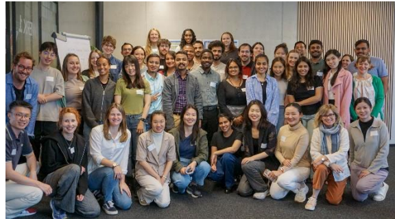
Global Fellows Program 2025

We were delighted to host this year's Global Fellows Program in Munich, welcoming doctoral candidates from Imperial College London, Nanyang Technological University Singapore, and the Technical University of Munich. This unique trilateral summer school, held over five days, rotates annually between Munich, London, and Singapore, offering participants a dynamic platform to strengthen essential soft skills such as collaboration, communication, and creativity. The 2025 program centered on the theme "Multidisciplinary Solutions for Climate-Responsive Societies."