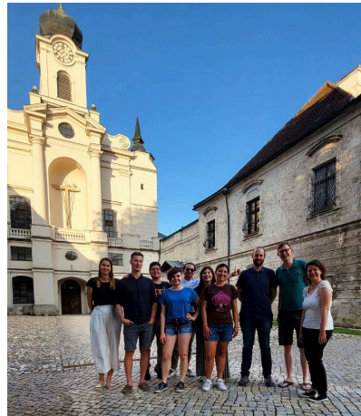
TUM GC Retreat

The TUM Graduate Council sends warm greetings from their retreat at the TUM Science and Study Center Raitenhaslach in July 2022. During the three-day trip, the Graduate Council reviewed the year of 2021 and planned the upcoming activities for 2022/2023. As some of you might know, the Graduate Council as the official representative body of doctoral candidates at TUM is always looking for new members. Thus, the Graduate Council is inviting everyone to join one of the next meetings or even the next retreat at the Science and Study Center Raitenhaslach.