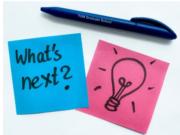
Sticky notes focus topic

“What's next?” During your doctorate, this question will most likely arise many times. As career planning is such an individual and complex process, we want to support you every step of the way. With this year's Transferable Skills Training on the focus topic: “What's next? Steps on my Career & Professional Development” we offer new perspectives and valuable advice, whether you want to pursue a career in academia, industry or any other sector. In addition to our numerous course offerings, you can look forward to expert talks, events and interviews on the topic throughout the upcoming academic year.