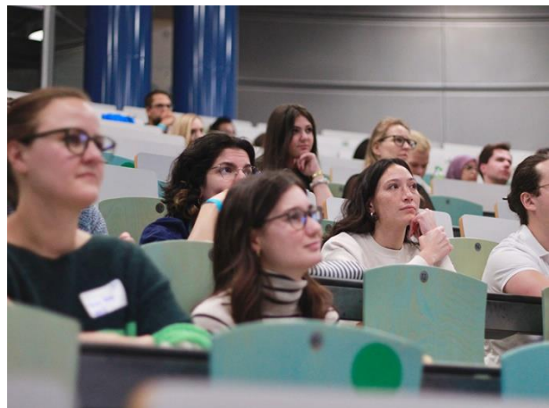
Audience at the TUM Doctoral Day