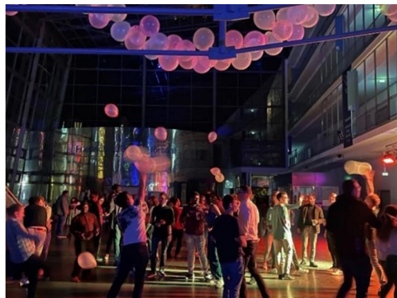
Party time at TUMblue!

Thank you to everyone who joined us and made this event unforgettable. We can't wait to see you at the next TUMblue!