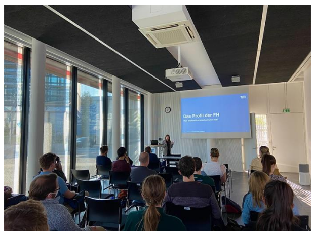
Attract2HM Project