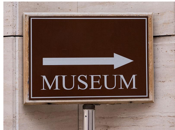
Museum sign