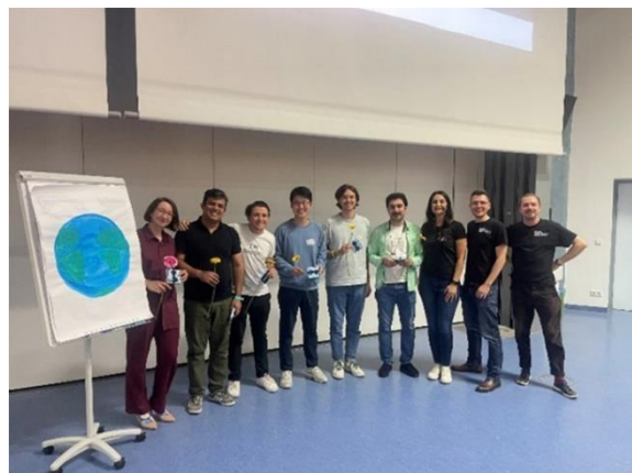
Participants of the Science Communication Competition

Stay tuned for more opportunities to showcase your work and shine at next year's TUMblue!