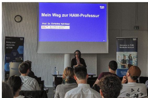
UAS Information Event in March 2025