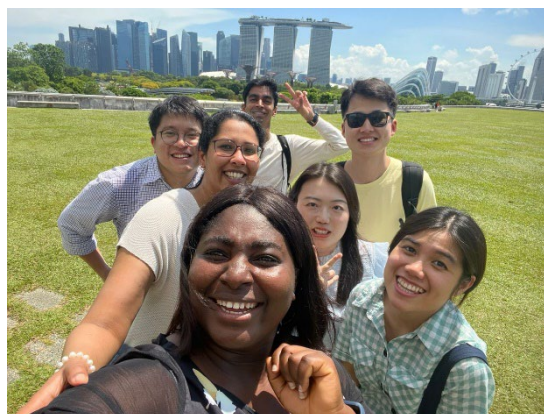
TUM doctoral candidates in Singapore

To make the application and reimbursement process easier, we've launched a wiki page dedicated to international mobility support. This platform provides detailed guidance on how to apply, outlines funding amounts, eligibility criteria, and deadlines, and addresses the most frequently asked questions about reimbursement. You can access the page using your TUM-ID.