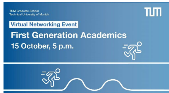
Two people running with and without obstacles