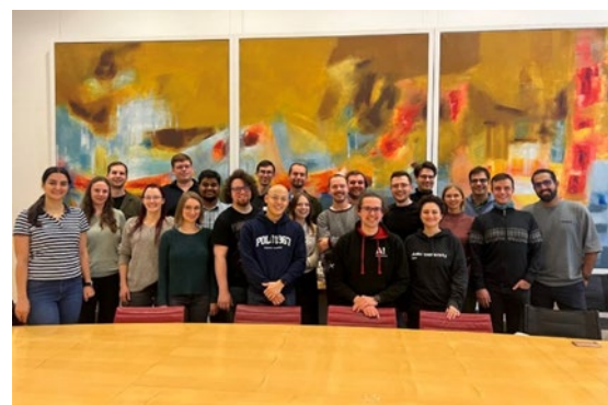
114th Graduate Council Meeting