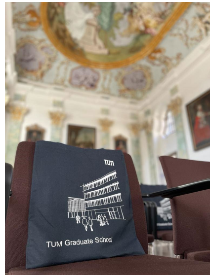
Our first Kick-Off on site since nearly three years