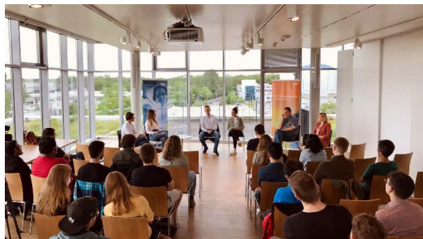
Impression from our last fireside chat with TUM: Junge Akademie

We are excited to announce our next fireside chat jointly organized with TUM: Junge Akademie on November 22, 6-8 p.m., TUM Graduate School, TUM Campus Garching-Forschungszentrum. Many roads lead to a fulfilling career – no matter if staying in academia is your ultimate career goal or just a milestone towards an industry employment or other purposes. However, one thing is certain. Irrespective of what career path you will choose, there will be others competing for the same position or opportunity.