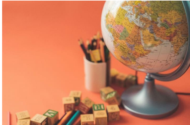
A globe on a desk

Dynamically changing research fields and globally intertwined working environments require future leaders to be equipped with international skills. The best way to prepare for this is to do an international research stay or participate in activities abroad. The TUM Graduate School internationalization support of up to 1,600/3,000 EUR for individual mobility enables you to further develop your international portfolio and expand your network globally. We collected detailed information about how to apply for our TUM-GS internationalization support in our TUM-GS wiki on internationalization support . Please also remember to check out our extensive FAQs on internationalization support.