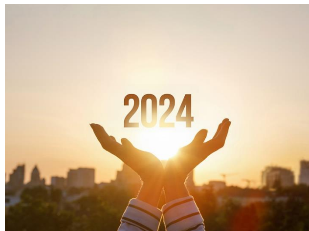
Hands holding 2024 phrase in the sun