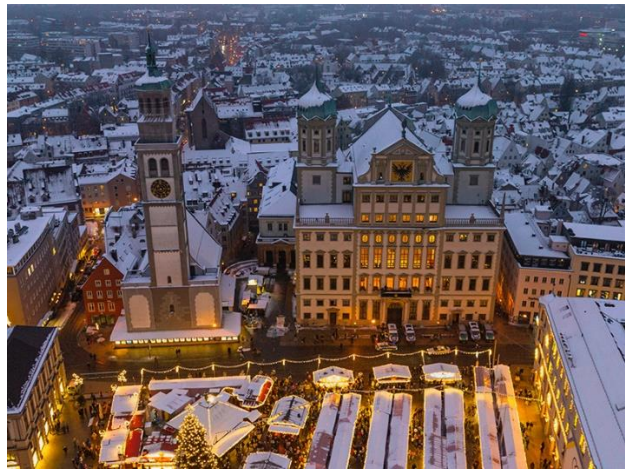
Christmas Market Augsburg

Have a look at our other Welcome@TUM-GS events in January and February 2025, too, and save your spot as soon as possible.