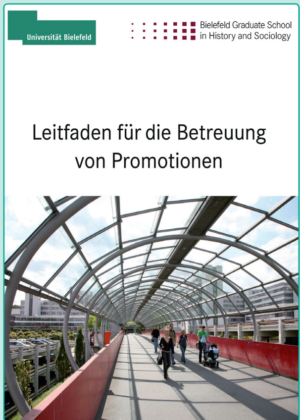
Fig. 2: Cover page of BGHS guideline

The working group came to the result that a set of standards would most likely create concerns of over-standardising the supervision relationship, and rules or recommendations would probably be met with reluctance. This is why it was decided to develop guidelines for the doctoral phase that users would feel bound to without imposing rigid standards or regulations. The result was a guideline that provides doctoral supervisors and candidates with tips on how to shape their supervisor-supervisee relationship. It is designed as a practical handbook on strengthening the work alliance between supervisor and doctoral researcher, on how to clarify mutual expectations right from the beginning on and on how to make binding working arrangements in order to avoid conflicts in supervision.