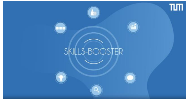
Skills Booster graphic