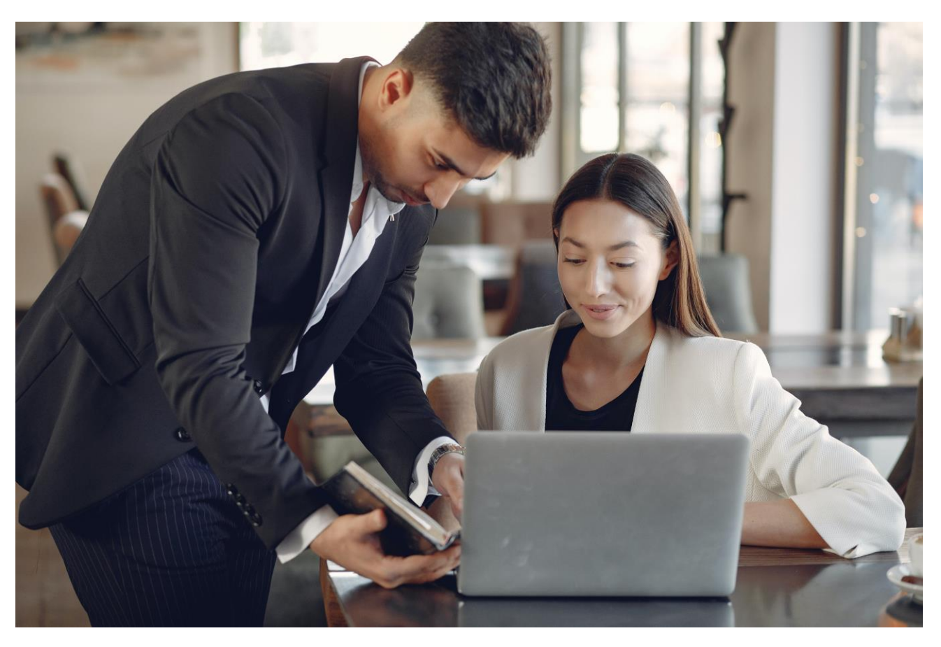
Two people in an office