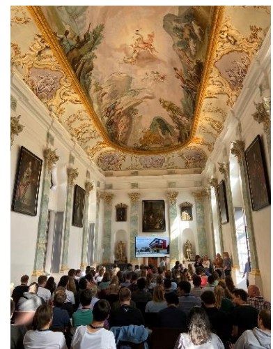
Kick-Off Seminar 2023

Don’t miss your chance! From September 27, at noon, you can register for more TUM-GS Kick-Off Seminars from March to July 2024. During the 3-day-Kick-Off Seminar, which takes place in the Science and Study Center Raitenhaslach, you will not only get interesting information about the academic work and the diverse offerings at TUM, but it’s also an excellent opportunity to meet other fellow doctoral candidates from different disciplines, gain new perspectives and expand your personal network. Don’t wait until the last minute and sign up for this great event!