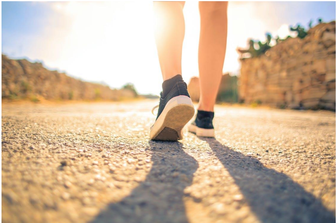
Person walking on path under the sun