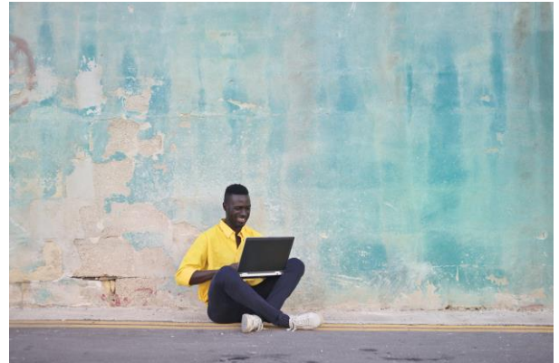
Picture of a man sitting and typing on his laptop