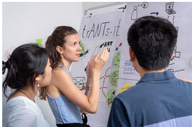
ICL-TUM Summer School 2019

Participants will also have the opportunity to apply those skills and competencies to address topics under this year's program theme "The role of robotics in well-being and the workplace". Guest speakers from Imperial, NTU and TUM will provide participants with insight into current research in (but not limited to) human-robot interaction, the future of work, policy making and ethical aspects of robotics and AI, impact of rapidly advancing technologies on everyday wellbeing, as well as robotic technologies for elderly & health care.