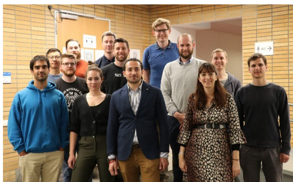
95 th Graduate Council meeting

On Wednesday, May 04 th , the Graduate Council (GC) had the first in-person meeting since October 2021. The meeting was held at the TUM Downtown Campus and the GC welcomed the newly elected representative of the International Helmholtz Graduate School for Plasma Physics (HEPP) as well as a new member from the School of Engineering and Design. Within the meeting, the GC discussed the current state of the school transition, the planned activities of the Graduate Council in 2022 and the current projects of its working groups .