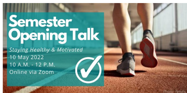
Semester Opening Talk