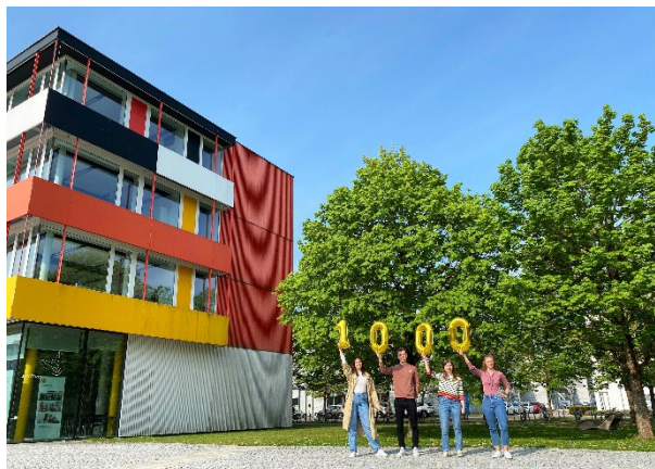
The TUM-GS team celebrating 1000 followers