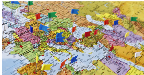
There are many different possibilities to go abroad

Do you want to gain international and intercultural research experience? Expand your network and get to know a new university and (research) culture abroad? Join our four-part remote event series " International mobility funding options for doctoral candidates " from April 11 th until April 21 st in collaboration with TUM Global & Alumni Office, the TUM Global Liaison Offices São Paulo and San Francisco, as well as the German Academic Exchange Service (DAAD). All doctoral candidates and interested persons at TUM are invited to join our info sessions.