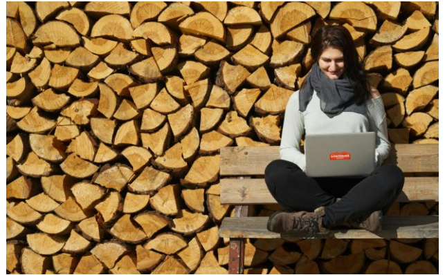
Picture of a woman sitting on a bench with a laptop