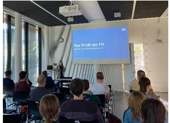
Infoveranstaltung Karriereweg