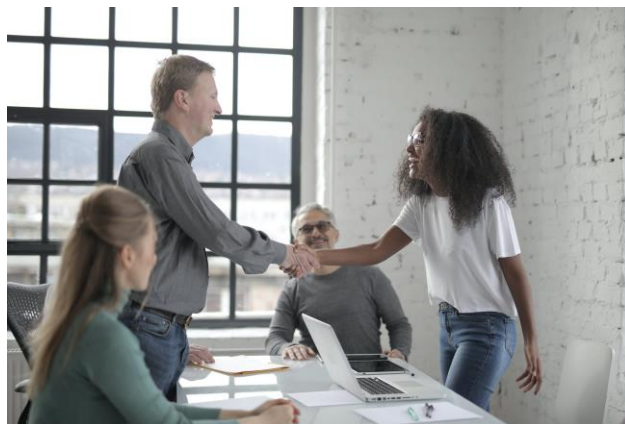
Picture of a group of people and two of them are shaking hands

The workshop provides an overview of the German research and innovation system and addresses the particularities of conducting research in higher education institutions, non-university organisations and the private sector. It explores essential professional skills to become an independent, internationally visible researcher and raises strategic issues in career development, such as geographical, thematic and intersectoral mobility. The course aims to assess the current researcher position, to identify individual career goals and to develop a road map for how to achieve them.