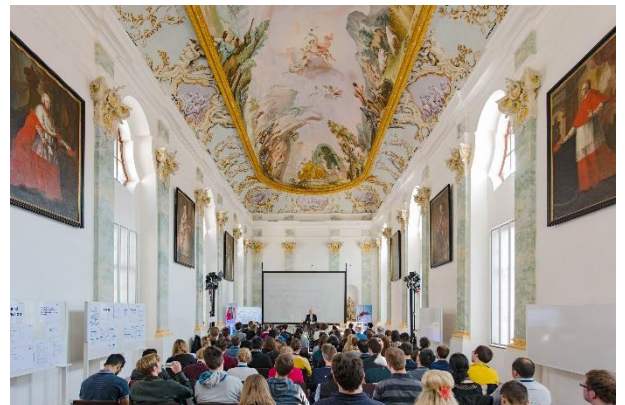
Impression from our Kick-Off Seminar.

Please have a look at our website and our wiki for more information and the upcoming dates.