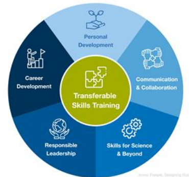
Transferable Skills Training graphic

Don't miss this great opportunity and mark your calendars!