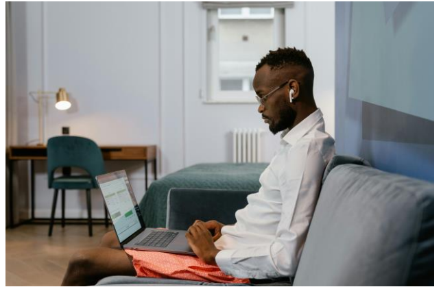
Picture of a man sitting on a couch typing on a laptop

Do you want to work joyfully every day in your professional future? Would you like to define and pursue your career path in a focused yet flexible manner? Do you want to successfully realize your professional dreams, wishes and goals through project, time and self-management? This course will provide you with various tools that will make it easier for you to plan and shape your professional future now. You will learn how to define your career path and achieve your professional goals happily and successfully.