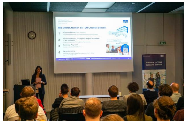
Impression from our last Attract2HM event