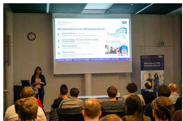
Impression from our last Attract2HM event.