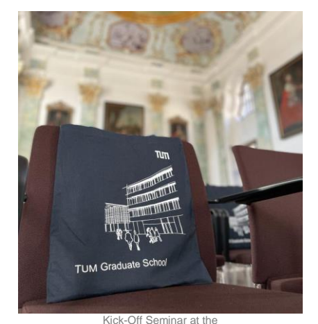
TUM Akademiezentrum Raitenhaslach (Image: TUM-GS)