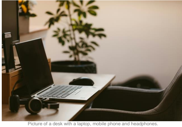
Icture of a desk with a laptop, mobile phone and headphones.

We all know the situation: when the tasks pile up, we often jump back and forth between countless tabs in the browser every minute in order to keep all urgent projects running and at the same time make progress on our doctoral thesis. But what happens when we close the tabs, shut down the applications and close the laptop? In most cases, the mental processes continue to run in the background. In this workshop, we will immerse ourselves in the enormous power of silence in the midst of the creative process. Using guided mindfulness exercises, we will return to an experience that has often become completely foreign to many: peace of mind. The workshop provides tools that are suitable for everyday use so that we can find access to this stillness at any time.