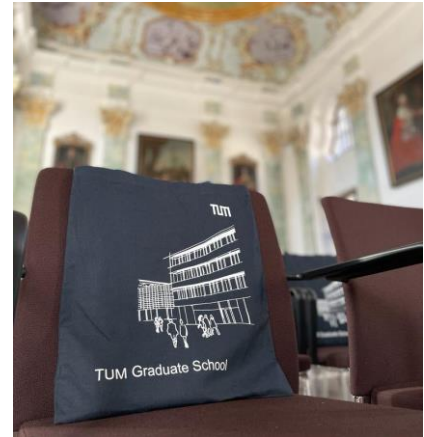
Kick-Off Seminar at the TUM Akademiezentrum Raitenhaslach