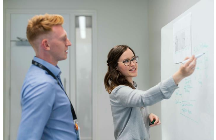
Picture of two people standing in front of a whiteboard.