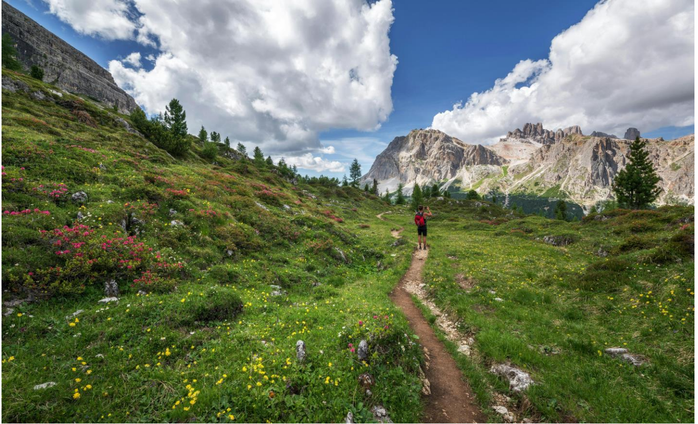
Picture of a woman taking a photo of the landscape