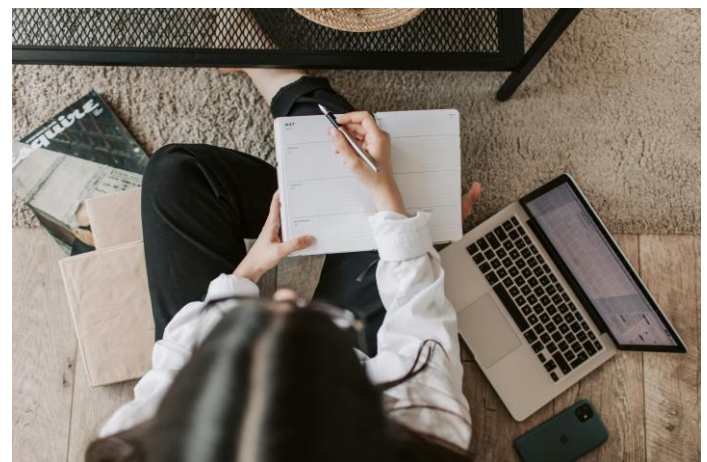
Image of a person sitting on the floor taking notes in their agenda.

We've all been there: a full day in front of the laptop, yet nothing to show for it. Zoom meetings fragment your schedule, your browser is a jungle of open tabs, and your inbox just won't quit. Valuable time for your dissertation seems to slip away. Effective time management isn't a luxury; it's essential for producing meaningful results and staying motivated. This workshop dives into the core principles of this vital skill, whether you're looking to fine-tune your current strategies or break free from cycles of unproductivity and frustration.