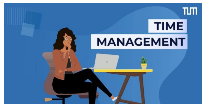
Skills Booster graphic