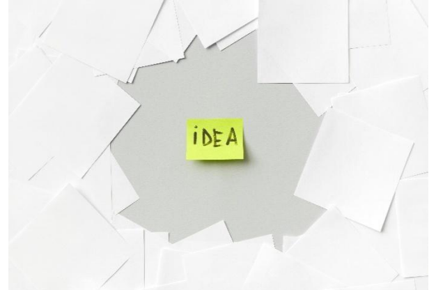
Graphic of white and yellow sticky notes.

Discover how Design Thinking can transform your research in this dynamic 2-day workshop. Learn to approach innovation from a human- and life-centered perspective, sharpen your communication and project management skills, and gain practical tools to move your research forward with clarity and creativity. Whether you're shaping a product, service, or research project, this training helps you work smarter, faster, and with greater impact.