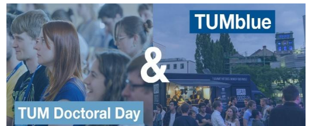
TUM Doctoral Day & TUMblue on September, 19

On September 19, 2025 , the university-wide TUM Doctoral Day will take place for the second time at the Munich main campus. All doctoral candidates are warmly invited to a varied program of engaging workshops, an exciting keynote speech and a lively panel discussion. In the evening, TUMblue , the legendary networking event for doctoral candidates, awaits you! Seize this opportunity to gain insights from experts, receive hands-on tips for your doctorate, expand your academic network and celebrate!